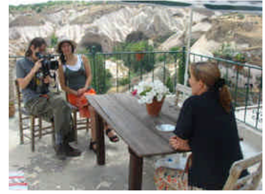
NIHA/KozaVisual at work in Ibrahimpaşa / Babayan